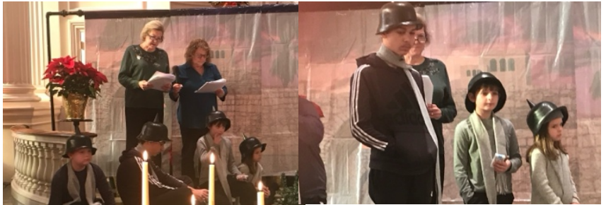
The Christmas Truce